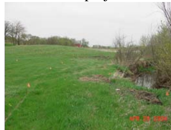
Riparian Buffers with Trees

Are you considering conservation this year? Some eligible conservation projects include: