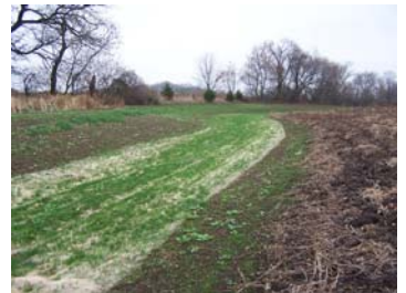
Grassed Waterway (above)